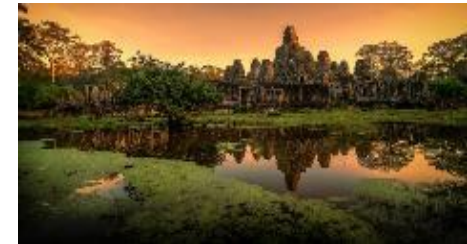
Construction: End of 12th century Religion: Buddhist

We suggest leaving from Zannier Phum Baitang at 3:00pm destination: the south gate of Angkor Thom, King Jayavarman VII ancient capital. From here you will be able to admire the remaining of the celestial palace Baphuon before entering the Royal Palace built in the 11 th and used for 5 centuries. A short walk will allow you to admire the remaining of the Elephant terrace a platform used by King Jayavarman VII to view his victorious returning army, further on you will reach Bayon. Bayon is position exactly at the center of Angkor Tom, it feature an astonishing bas-relief covered external wall, depicting Khmer life and war journeys. On the upper terrace, of the original 49 towers, 37 are still standing each of which supports two, three or (most commonly) four gigantic smiling faces oriented toward the cardinal points.