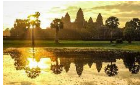
Construction: Mid 12th century Religion: Hindu

To capture the perfect Angkor sunrise photograph and if you have no concerns with crowds of other travelers, we suggest you to request a wake-up call, early enough to allow a departure from Zannier Phum Baitang at 5:00am. You will reach your destination, the main entrance to Angkor Wat and the west causeway at approximately at 5:25am. Angkor Wat is the centerpiece of all the temples of Angkor, it was built during the reign of King Suryawarman II in the form of a massive “temple mountain” dedicated to the Hindu God, Vishnu. Angkor Wat is quite an unconventional temple as it has westward orientation. This has led some to suggest it was constructed as King Suryavarman II’s funerary temple. It becomes a must visit during the equinox as the Sun will raise right behind the main central tower.